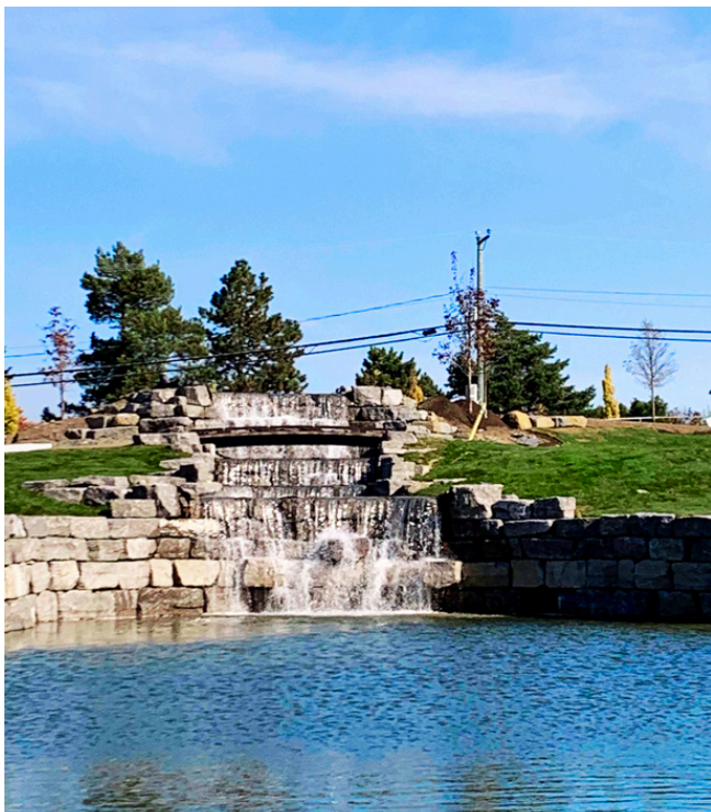
New lake and waterfall Red Course Hole #8