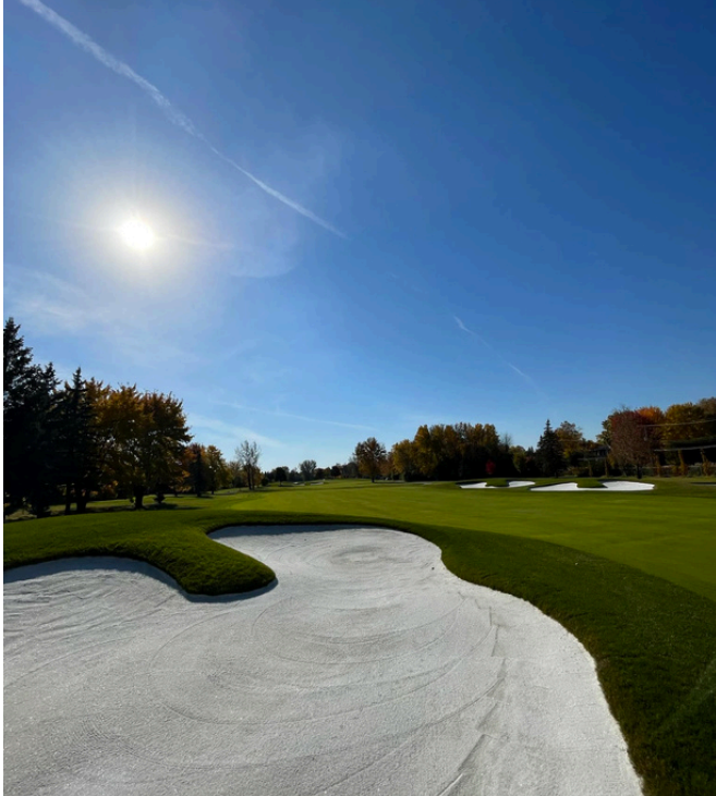
New sand traps Red Course Hole #4