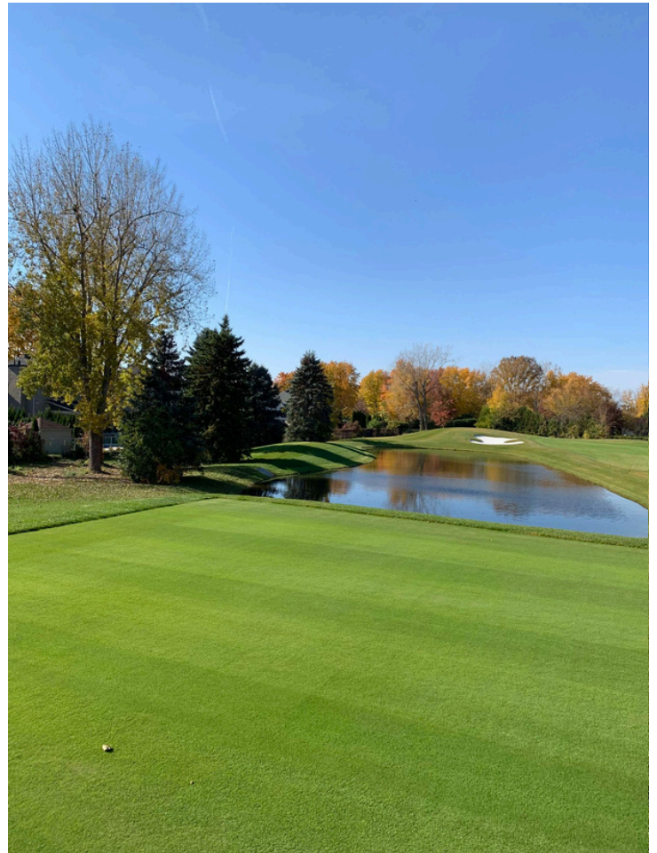
New lake Red Course Hole #3