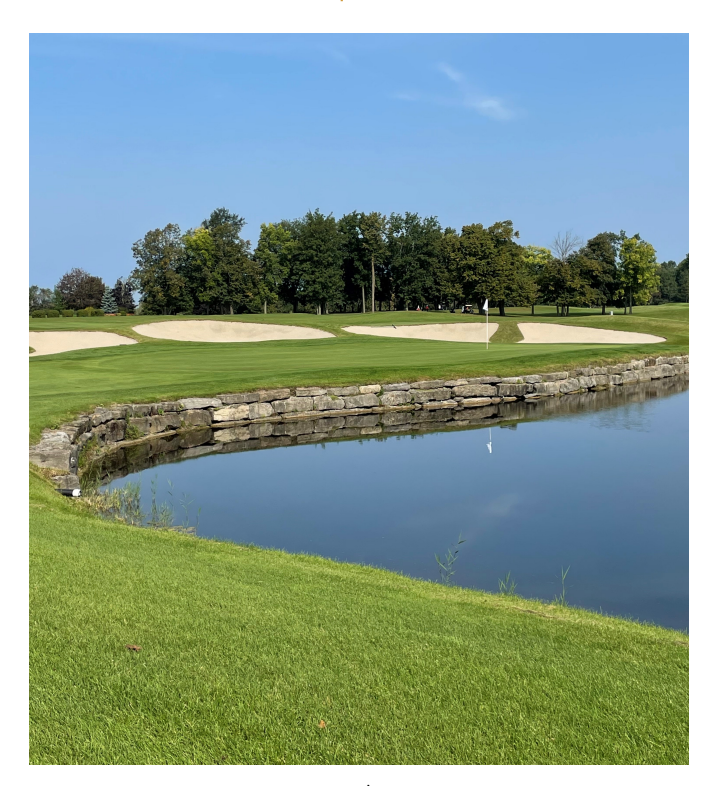
New sand traps Blue Course Hole #18