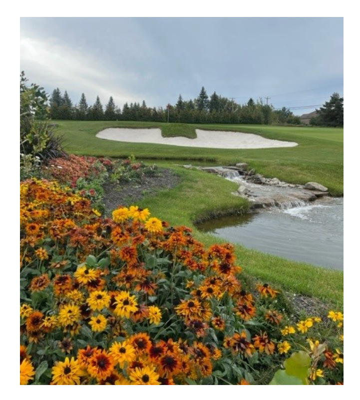
New sand traps and gardens Red Course Hole #9